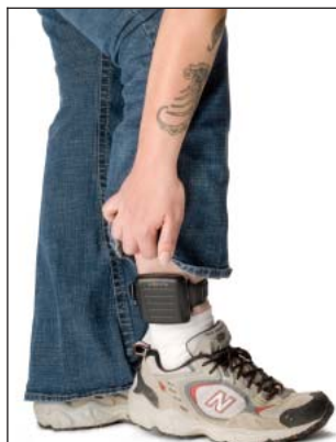
The bracelets have helped thousands stay sober.