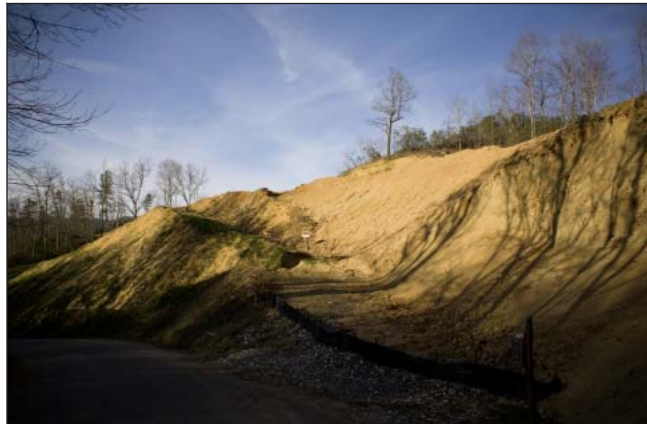
Visible from Kituwah is the site across the river where Duke Energy began clearing land for a relay station.

Then last year that view was threatened. Duke Energy began clearing land on the other side of the river – but within view of Kituwah – in preparation for a regional equipment upgrade to boost power deliv-