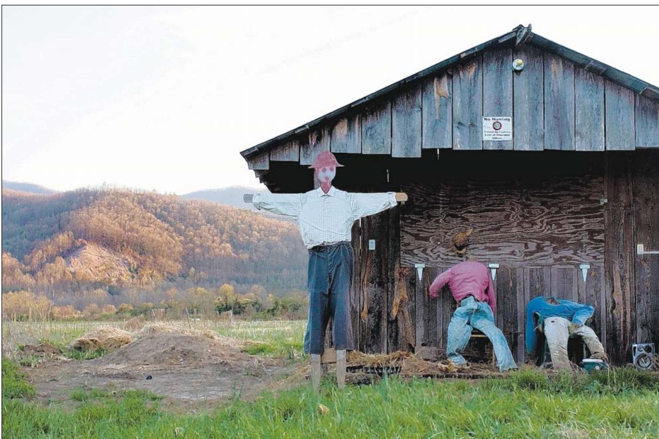
Scarecrows rest at a barn in the Kituwah valley near Bryson City. Much of the valley is leased to Cherokee tribal members for farming. The valley contains the Kituwah mound, said to be the birthplace of the Cherokee nation.