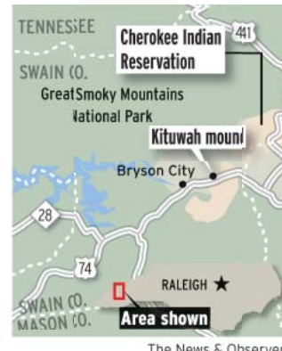
The News & Observer