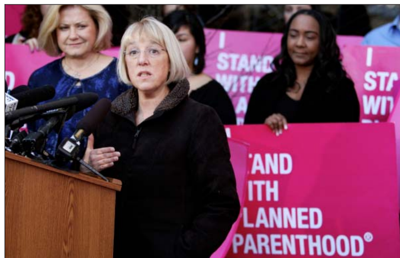
U.S. Sen. Patty Murray speaks at the Seattle Planned Parenthood on Friday, after the Komen Foundation reinstated grants to the group.

Komen had adopted criteria excluding Planned Parenthood from future grants for breast-cancer screenings because it was under govern-