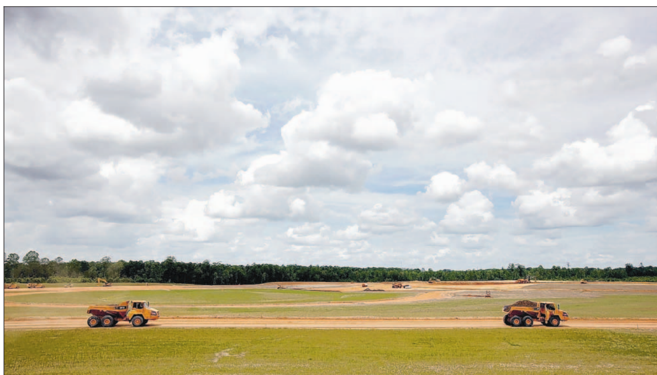
The N.C. Center for Automotive Research, under construction near Roanoke Rapids, got half of its $15 million in state money under the condition that a private partner promise to create jobs. That hasn't happened.