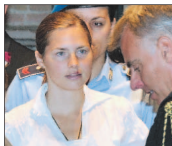
Amanda Knox is on trial for the stabbing of her British roommate, Meredith Kercher.