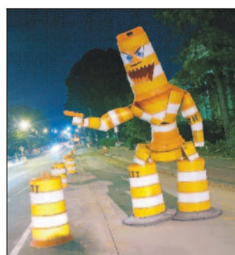
The Barrel Monster was seen on Hillsborough Street in Raleigh in late May.