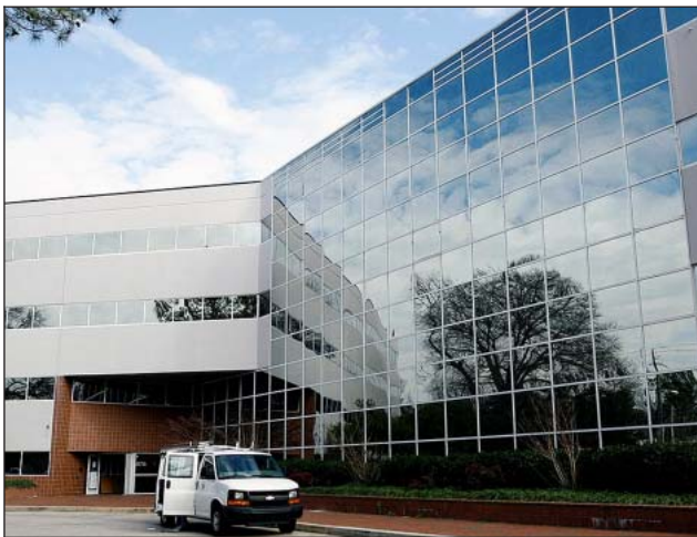
The Wake County Public School System building on Wake Forest Road is depreciating in value every day.

But in a stagnant real estate market, the question facing school system leaders is whether they can afford to be choosy by holding on to buildings, including the former headquarters building on Wake Forest Road, that are depreciating in value each day.