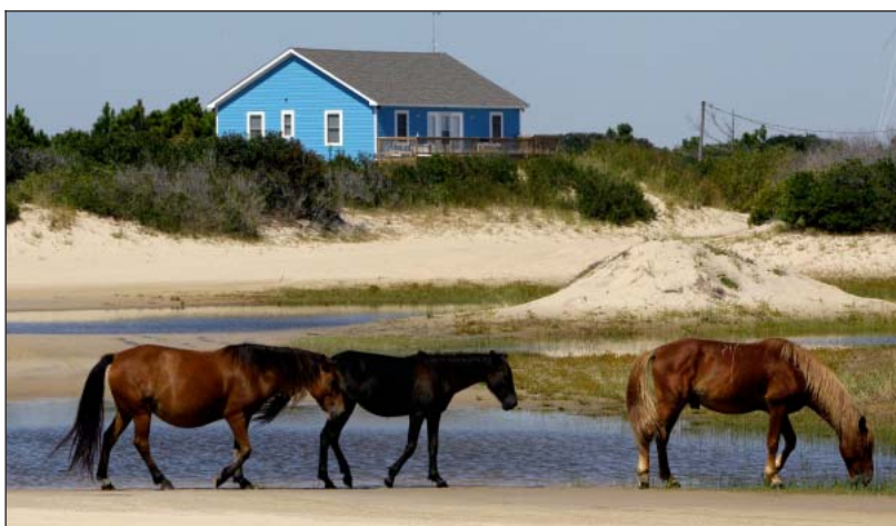
The U.S. Fish & Wildlife Service had wanted to trim the herd of wild mustangs to 60 from its current level of 140.